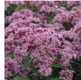
Eupatorium maculatum 'Riesenschirm'