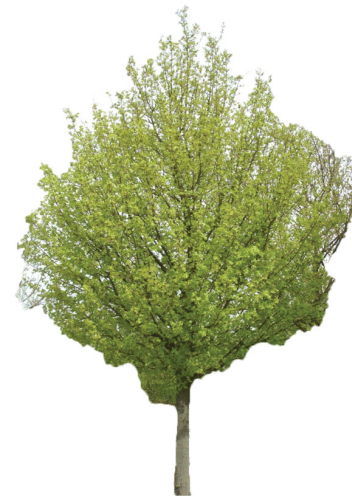
Acer campestre 'Elsrijk'