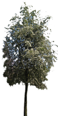
Crataegus monogyna 'Stricta'