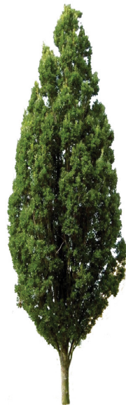
Quercus robur 'Fastigiata'