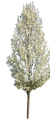
Pyrus communis 'Beach Hill'