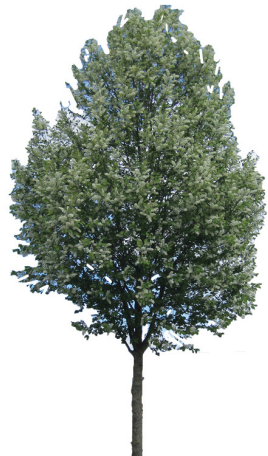
Prunus padus 'Albertii'