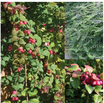
Symphoricarpos doorenbosii 'Hancock Low'