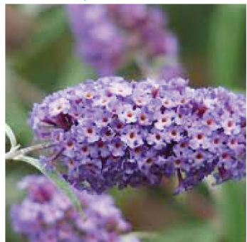
Buddleja davidii 'Blue Chip'