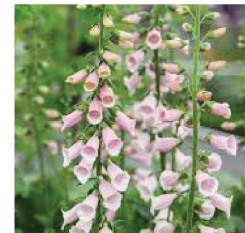
Digitalis purpurea 'Sutton's Apricot'