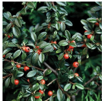
Cotoneaster dammeri 'Mooncreeper'