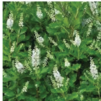
Clethra alnifolia 'White Spire'