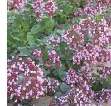
Origanum laevigatum 'Herrenhausen'