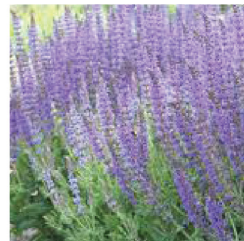
Salvia nemorosa 'Mainacht'