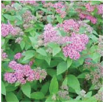
Spiraea japonica 'Manon'