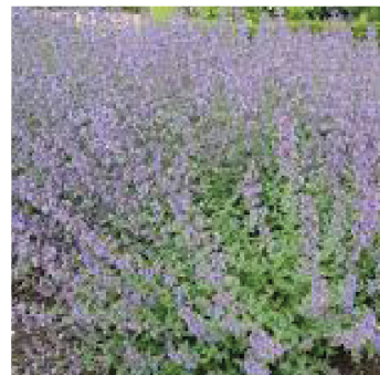
Nepeta faassenii 'Walkers Low'