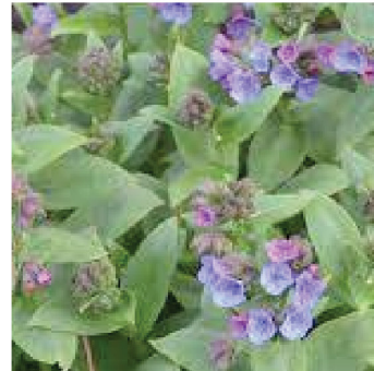
Pulmonaria angustifolia 'Azurea'