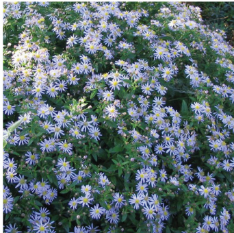
Aster ageratoides 'Asran'