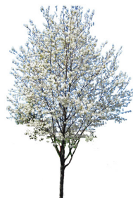
Amelanchier lamarckii 'Ballerina'