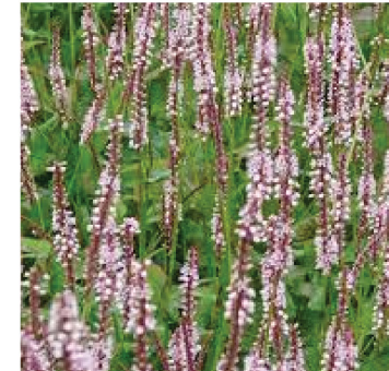
Persicaria amplexicaule 'Rosea'