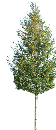
Betula albosinensis 'Fascination'