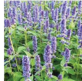
Agastache 'Blue Fortune'