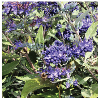
Caryopteris clandonensis 'Blauer Spatz'